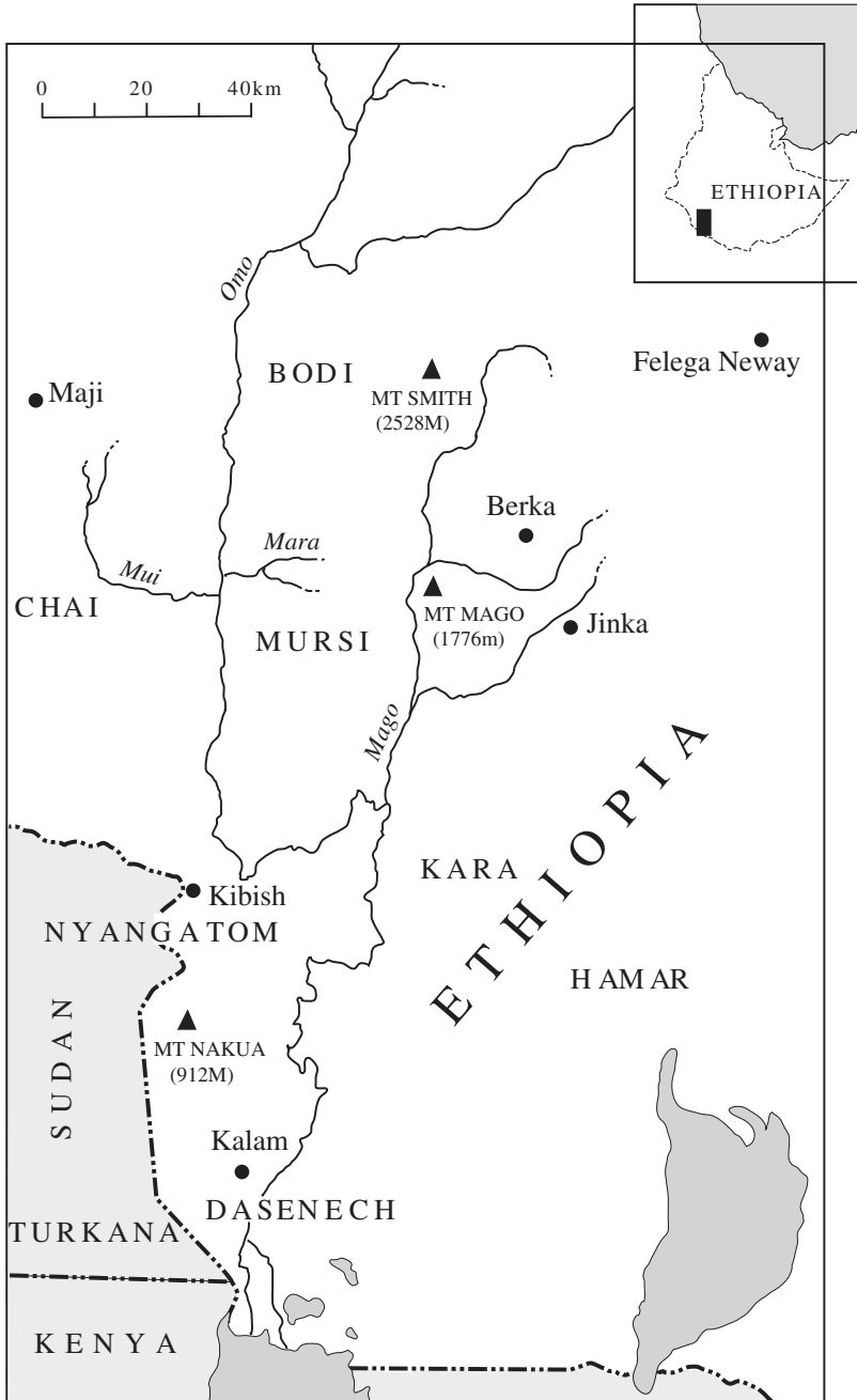
Figure 1 The 'Peoples and Cultures' of the Lower Omo Valley